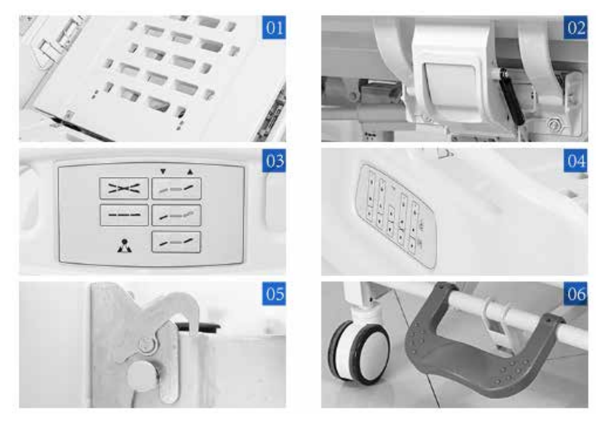
01 Bed board : The bed surface is detachable and has a handle for easy cleaning also it with vent holes for ventilation.